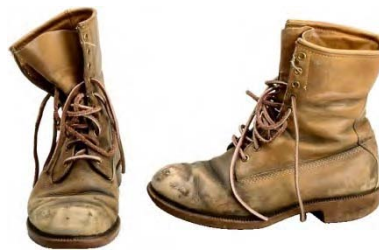
Need to fill in these shoes

At the Zebec Offices, we require Document Controller, Govandi Assistant Manager – Technical / Electrical for the Technical Office, Govandi Manager-Marine Projects Senior Naval Architect / Manager – Design is required in the Design Office, Goa Senior Naval Architect, Singapore