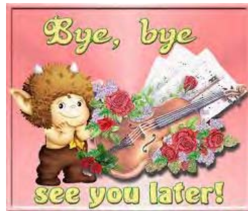
Will miss you

Every exit is as painful to the employee as well as to the employer.