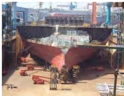
Build them good

Introducing the DESS project at the Cochin Shipyard 2 OSVs will be made at the ABG Shipyard in Surat for the Sealion project Varada Marine at the ABG Port in Dahej will see the making of 10 AHTS The Fugro Gulf Inc project will see 4 Geotechnical Research vessels being made 2 Nos 4500 DWT MPVs will be made for JR Shipping at the Chowgule Shipyard in Goa.